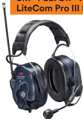
3M™ PELTOR™ WS™ LiteCom Pro III Headset