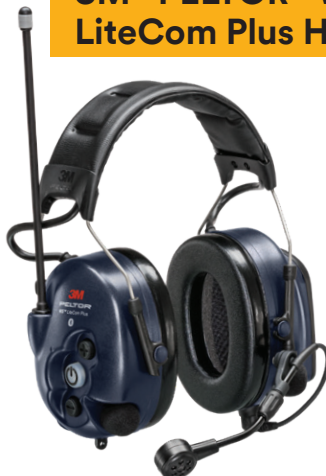
3M™ PELTOR™ WS™ LiteCom Plus Headset