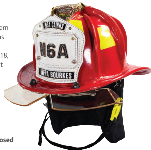
N6A Helmet with NFPA-compliant Bourkes

MSA takes this statistic seriously. Now, every MSA Cairns Leather Fire Helmet ordered through Assemble-to-Order (ATO) after August 1, 2018 3 will offer only removable, washable soft goods. Plus, for a limited time, every MSA Cairns Leather Fire Helmet will also ship with a FREE mesh laundering bag. There are three options available on the ATO: yellow nomex, black nomex or PBI/Kevlar (Moisture Barrier) ear cover. Additionally, each of these soft goods is available as a kit, complete with a laundering bag. 3 Order an extra set so you can always have a clean one!