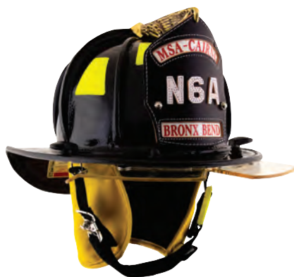
N6A Helmet with NFPA-compliant Bourkes and Bronx Bend

Don't take a chance on ruining your fire helmet and voiding the warranty ... if you want your fire helmet brim bent, order your MSA Cairns Leather Fire Helmet with a Bronx Bend!