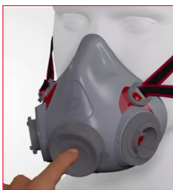
POSITIVE USER SEAL CHECK MECHANISM

AVIVA has been designed with the safety and comfort of the wearer in mind. With a number of features designed to improve comfort, fit and user confidence, workers can be assured that their half mask fits and will protect against a wide range of hazards. Patent information is available at www.scottpatents.com