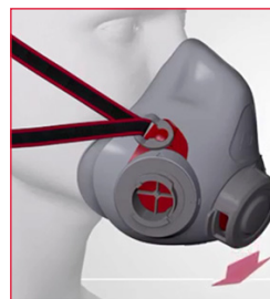
DOWNWARD FACING EXHALE VALVE