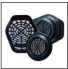
742 Series Twin Cartridges

Multiple filter options allow for use in a variety of environments