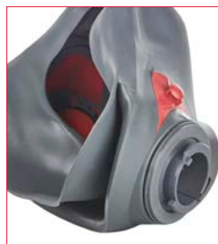
HYBRID REFLEX SEAL