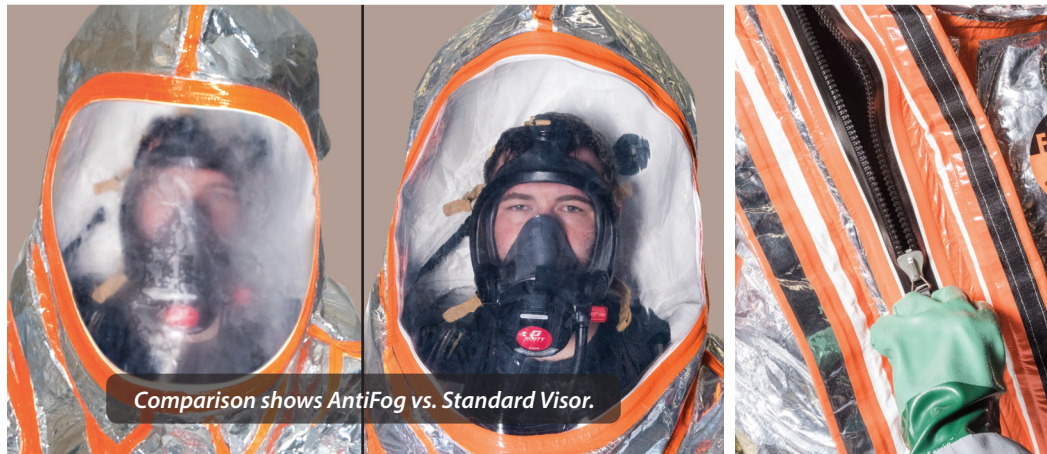
Comparison shows AntiFog vs. Standard Visor.