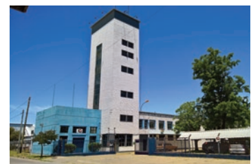
Manufacturing Facility Buenos Aires, Argentina