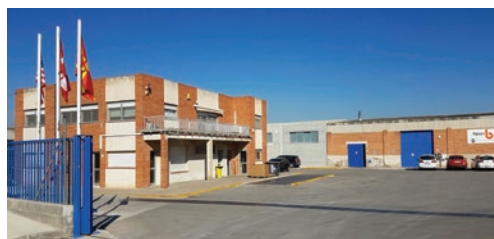
Manufacturing Facility Barcelona, Spain