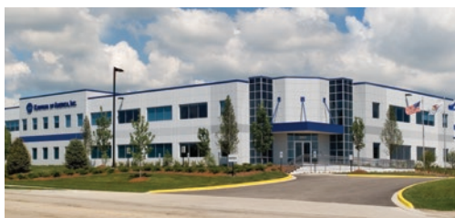
U.S. Headquarters Schaumburg, IL